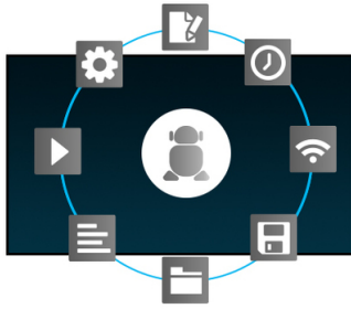
Android İşletim Sistemi

This ELED VA display consumes significantly less power compared to DLED IPS while maintaining the same level of brightness. Its versatile orientation, sleek design, and 24/7 reliability ensure it seamlessly integrates into any business environment. Whether it's used in retail, corporate, hospitality, or educational settings, the LH3260HS-B1AG will undoubtedly captivate your audience and leave a lasting impression.