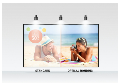
Optical bonded PCAP

The Full HD (1920x1080) Open Frame monitor ProLite TF2238MSC-B1 with IPS panel technology offers exceptional colors and wide viewing angles. The Optical Bonded Projective Capacitive (PCAP) 10-point touch technology ensures a seamless and accurate touch response and a lower light reflection, in addition, the display is protected against humidity and potential moisture development. A robust metal housing and a scratch-resistant 7H edge-to-edge glass with anti-fingerprint coating make the monitor particularly suitable for integration in demanding environments. The monitor meets also a IPX1 protection rating, making it waterproof for a period of time against dripping water. The ProLite TF2238MSC-B1 can be used in landscape, portrait and face-up orientation. A perfect solution for kiosk systems, retail and interactive digital signage installations.