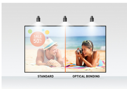
Optical bonded PCAP

The flexible stand can be positioned at several angles creating a comfortable and ergonomic user experience and the integrated cable management system hides all the cables and electrical wires giving a neat and cable-free workspace. The ProLite T2238MSC-B1 can be used in landscape, portrait and face-up orientation. A perfect solution for interactive signage, instore retail, POS and interactive presentations.