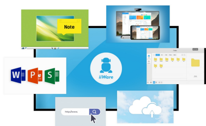
iiWare 8.0 (Android OS)

Share, stream and edit content from any device directly on screen and transform your team meetings or lessons into an easy, fast and seamless interactive session with the included WiFi module ( OWM001 ) and the ScreenSharePro app.